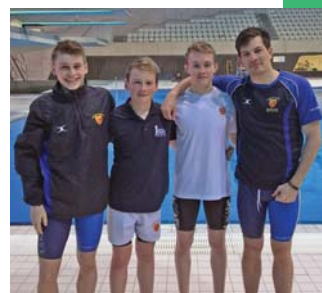
Our Senior Swim Team competing at the Bath Cup in the London Aquatic Centre.

Our swimmers have had a busy and successful year. The Warwick 100s, our annual showpiece event was exceptionally well attended by visiting teams. Our U14, U16 and U18 teams all produced strong performances both individually and collectively. Whitgift won the overall title with Warwick being nudged into third place by Harrow.