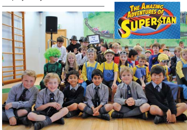
Our First Year Junior School boys thoroughly enjoyed Warwick Prep School's Lower Two production of Superstan.

A new addition to the event was a programme of illuminating talks from prestigious universities, covering the merits of degree apprenticeships, flexible combined honours and how universities endeavour to promote employability.