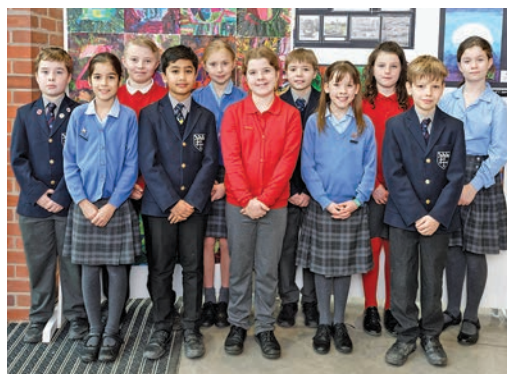
Artists from Coten End, Warwick Preparatory School and Warwick Junior School

There was a wonderful display of work on show and the young artists and their families gathered for a special 'Opening Ceremony'. The exhibition ran for a week where the public were able to come and view the extraordinary range of artwork.