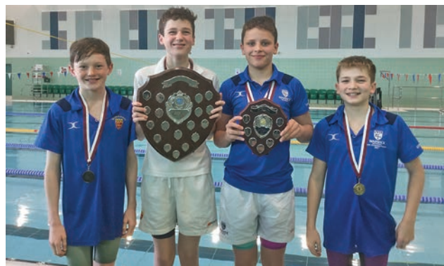
U13 relay team at Bromsgrove.

Our U13s team capped off their season with an impressive performance at the Bromsgrove Invitational Junior Relays by winning the Freestyle and Medley relay events.