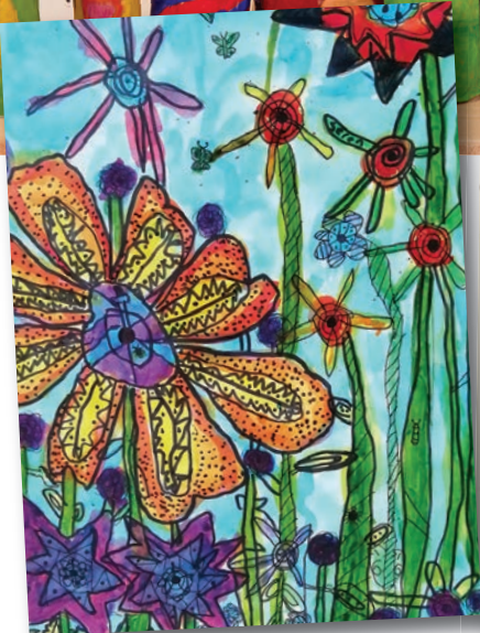
'Flower Power' | Bishop's Tachbrook School