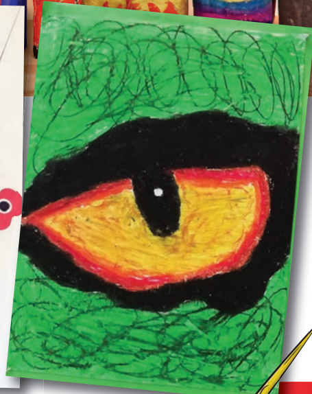
'Dinosaur Eye' | Coten End School