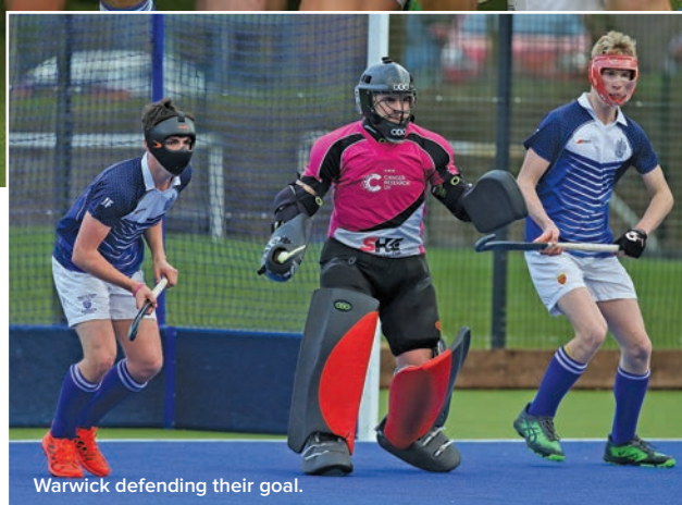
Warwick defending their goal.