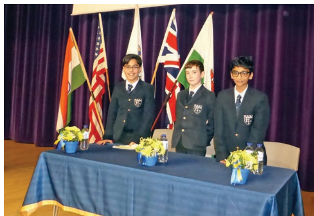
Intermediate winners of the Warwick Rotary 'Youth Speaks' competition.

We are very proud of all their efforts in their first major competition.