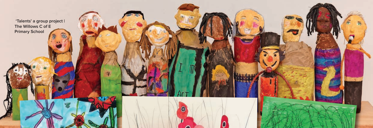
'Talents' a group project | The Willows C of E Primary School