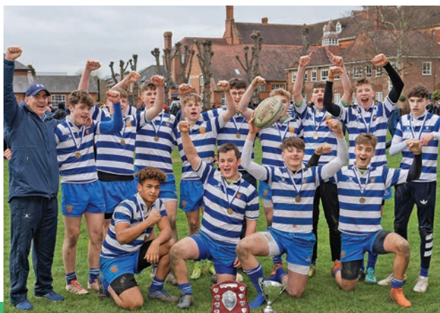
The victorious U16 squad.

U16 - Warwick; U15 - Millfield; U14 - Sedbergh; U13 - Warwick; U12 - Bishop Vesey's and Hampton School.