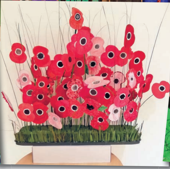
'Remembrance Poppies' | Warwick Junior School