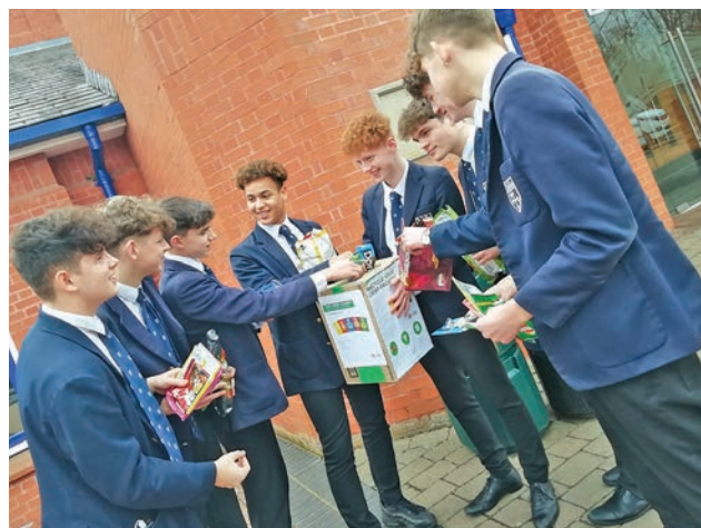
Year 11 Green Team members, recycling their crisp packets!

Boys are all being encouraged to remember to bring in their own reusable water bottles from home each day.