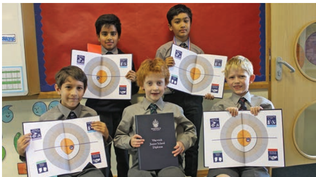
Boys with their first stickers towards their Bronze Diploma.

This term we launched the Warwick School Diploma, a challenge for all Warwick Junior School boys in which to take part, over their time here.