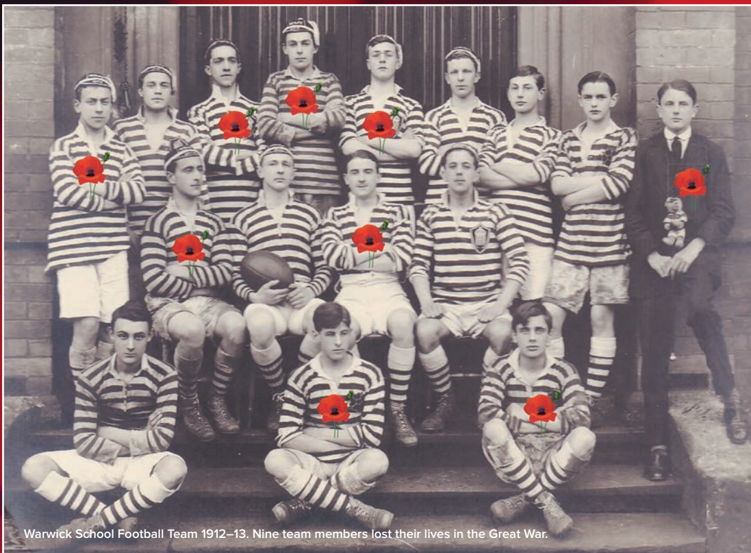
Warwick School Football Team 1912-13. Nine team members lost their lives in the Great War.