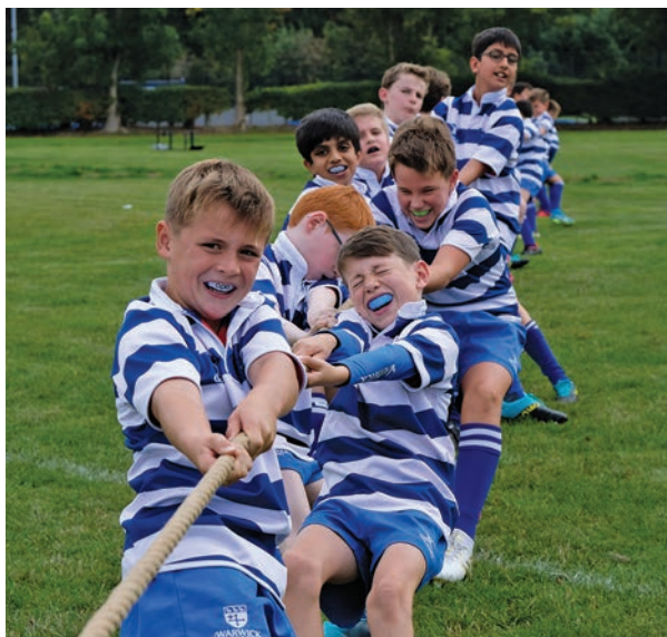
The expressions on their faces says it all!

All the Year 7 boys took part in the House Tug of War, won by Brooke House.