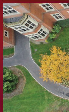
Grounds staff at