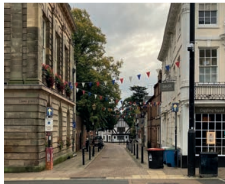
Historic Warwick town centre, only a 5 minute walk away.